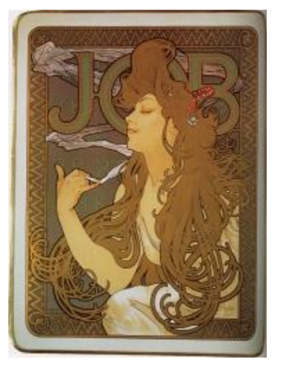
Poster by Alphonse Mucha

So, the two greatest influences on the emerging San Francisco poster scene were the organic forms and ornamentation of the Art Noveau period brought to bear on spiritual or meaningful topics.